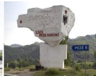
Peze e Vogël